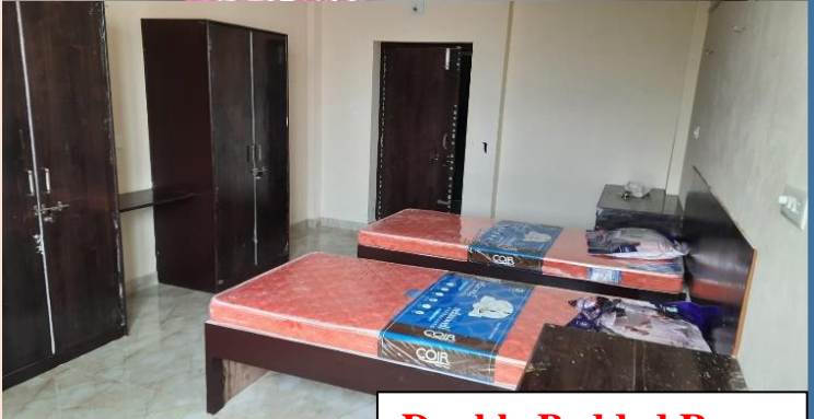
Double Bedded Room