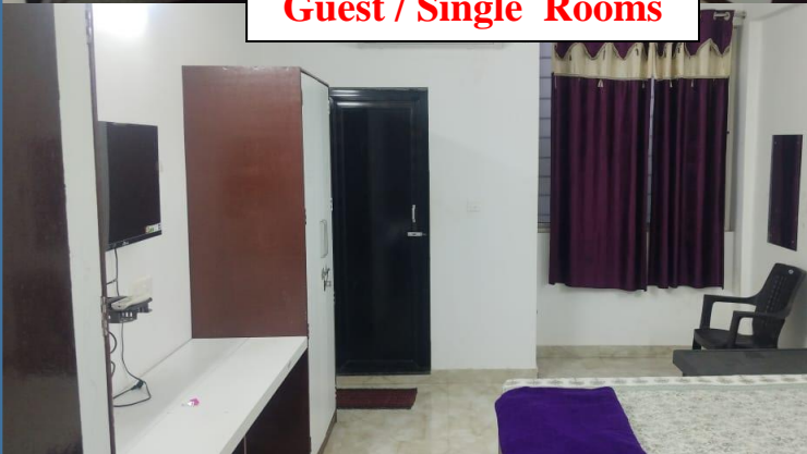
All Rooms with attached Toilet