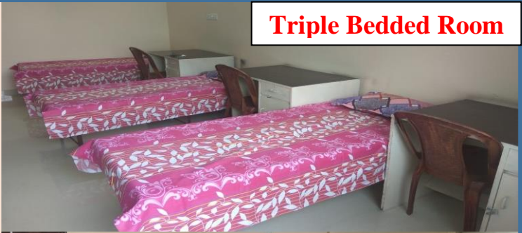
Triple Bedded Room